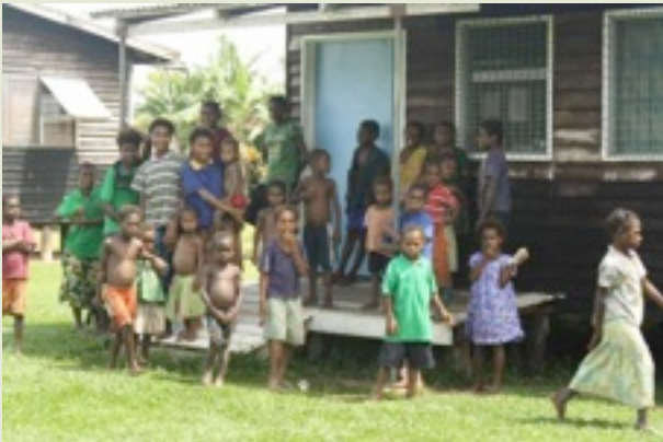
Note the bloated bellies in the children, a likely sign of malnutrition

A couple of weekends ago our family had the opportunity to travel an hour and a half upriver from where we live in Kawito, to a remote community for an outreach. We traveled by boat up to a village called Makapa on the Saturday, showed the Jesus Film that night and then my wife preached a message the following morning at church. At the end of the service we had organized to distribute the WOWNOW Albendazole tablets to everyone from the community who attended church that morning -- which totaled approximately 1,000