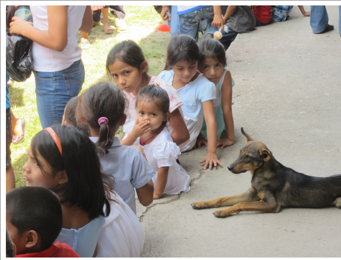
Children waiting in line for medical checkup and de-worming medicine