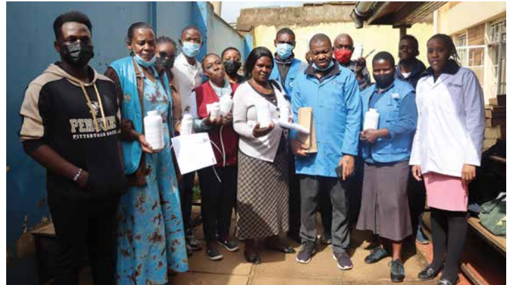
MAMA Kenya team ready for deworming.

Editor's Note: The Worm Project continues to work closely with MAMA Project as they help people living in the Kibera slums on the edge of Nairobi, Kenya. Kibera is considered the largest slum in Africa. Over the last four years, The Worm Project has supported their efforts by donating 900,000 Albendazole deworming tablets.