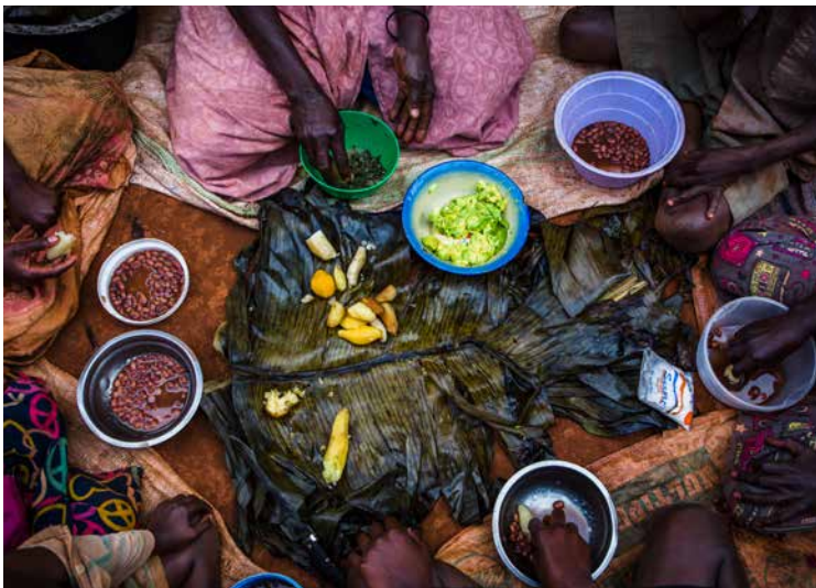
A typical meal in Uganda: beans and cassava root cooked in a banana leaf over a fire.

Intestinal worms, transmitted through contaminated soil, thrive in rural Uganda, especially among those who are barefoot during work or play. Ascaris, whipworm, and hookworm together constitute Soil-Transmitted Helminthiasis (STH). Schistosomiasis, another worm infection, spreads through contaminated water by freshwater snails that host the disease.