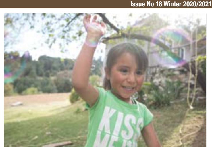
(Continued on page 2)