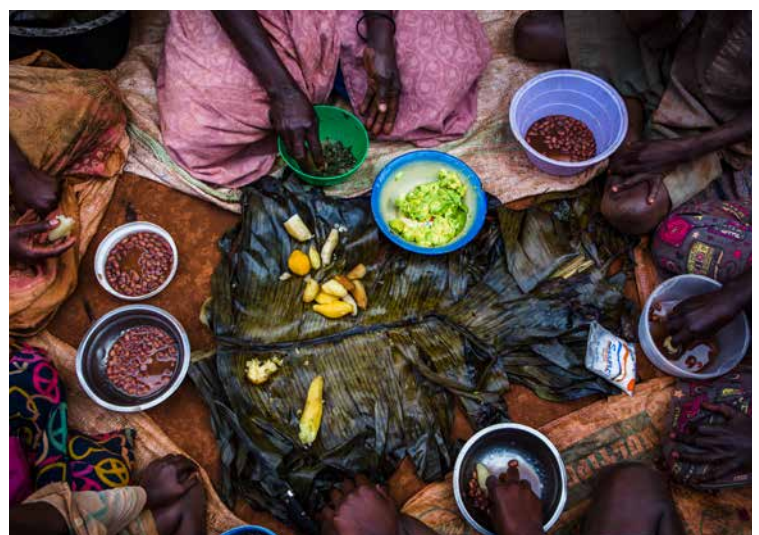
A typical meal in Uganda: beans and cassava root cooked in a banana leaf over a fire.

Intestinal worms, transmitted through contaminated soil, thrive in rural Uganda, especially among those who are barefoot during work or play. Ascaris, whipworm, and hookworm together constitute Soil-Transmitted Helminthiasis (STH). Schistosomiasis, another worm infection, spreads through contaminated water by freshwater snails that host the disease.